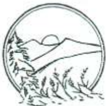
City of Tangent