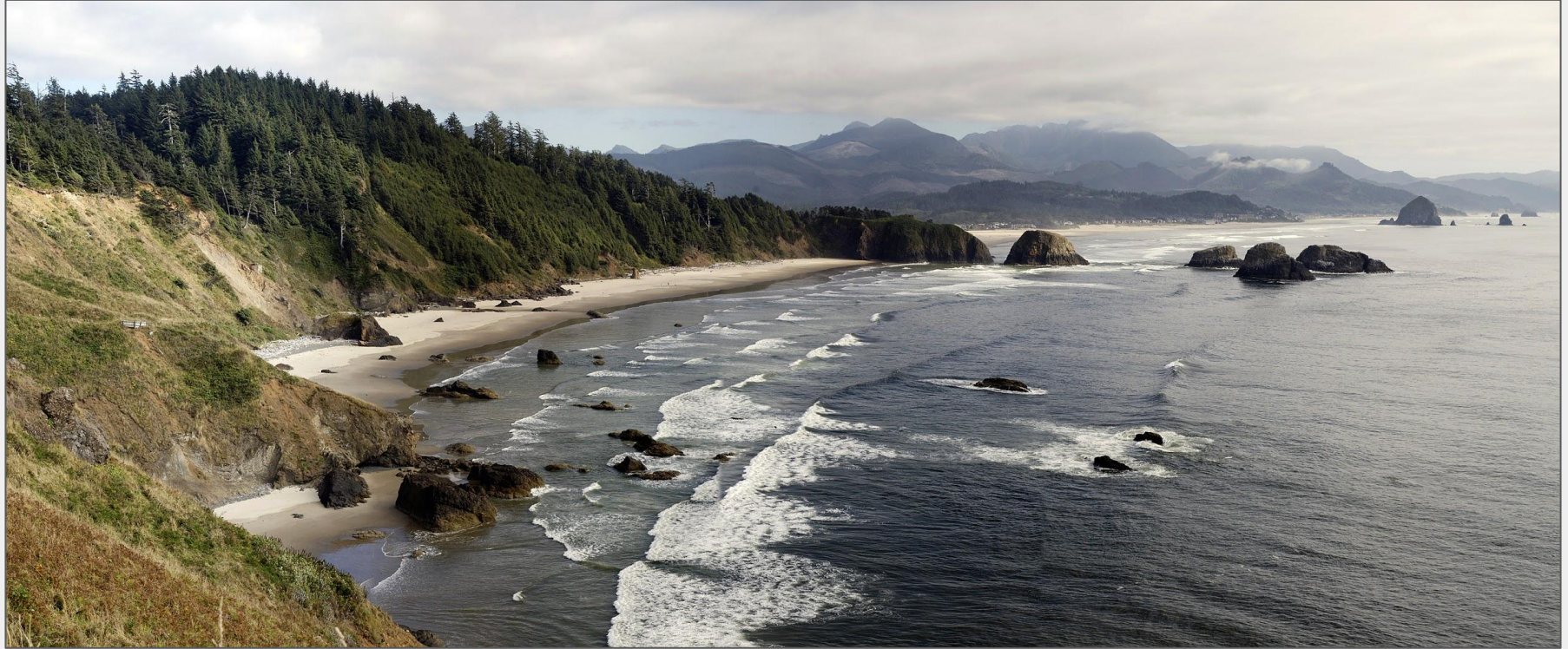
Southward view from Ecola State Park, Northern Oregon Coast

CWEDD: Benton, Lane, Lincoln, and Linn Counties